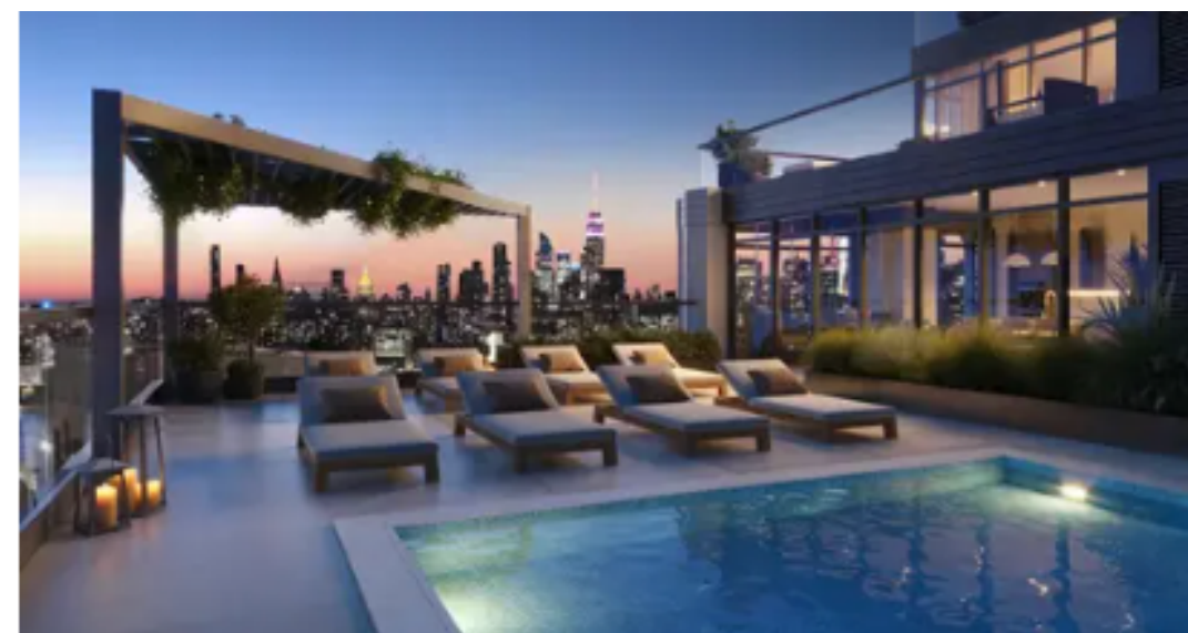
Rooftop swimming pool

The Dupont is a 40-story high-rise on the Greenpoint waterfront at 16 Dupont Street. All 381 studio to three-bedroom apartments feature oversized windows, hardwood floors, high-end finishes, central air conditioning, and in-unit laundry. Amenities include a fitness center, outdoor pool, business center, lounge, game room, children's playroom, pet spa, and terrace.