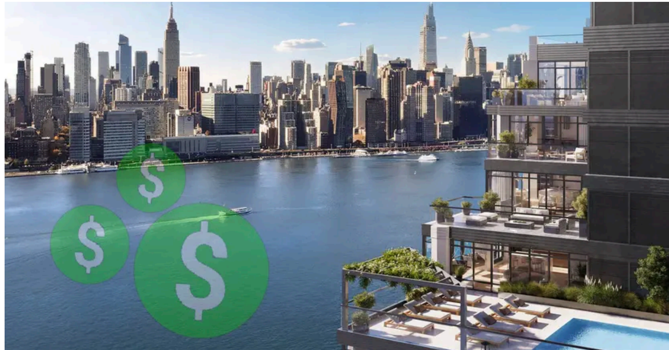
High floor amenities at The Dupont on the Greenpoint waterfront