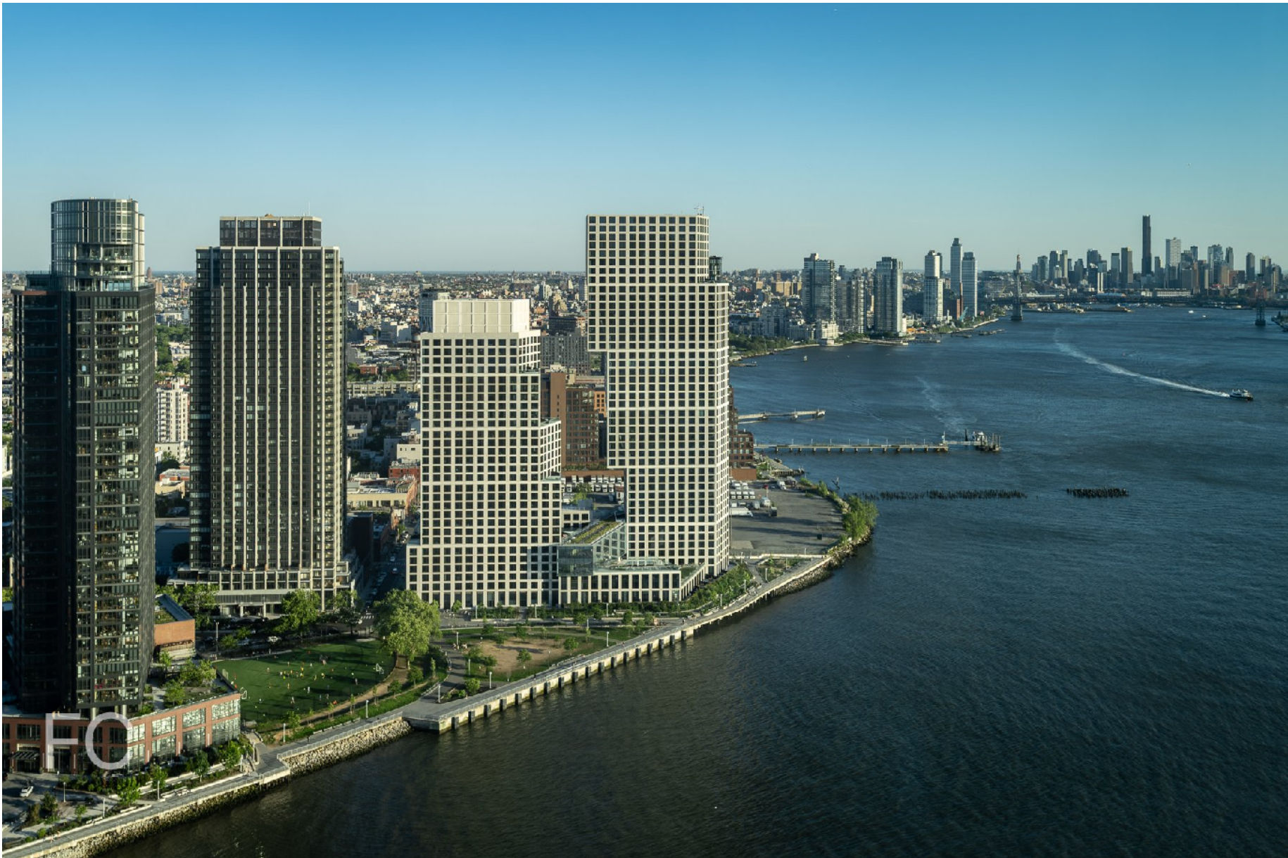
Two Blue Slip (left), 16 Dupont (center), and Eagle + West (right).