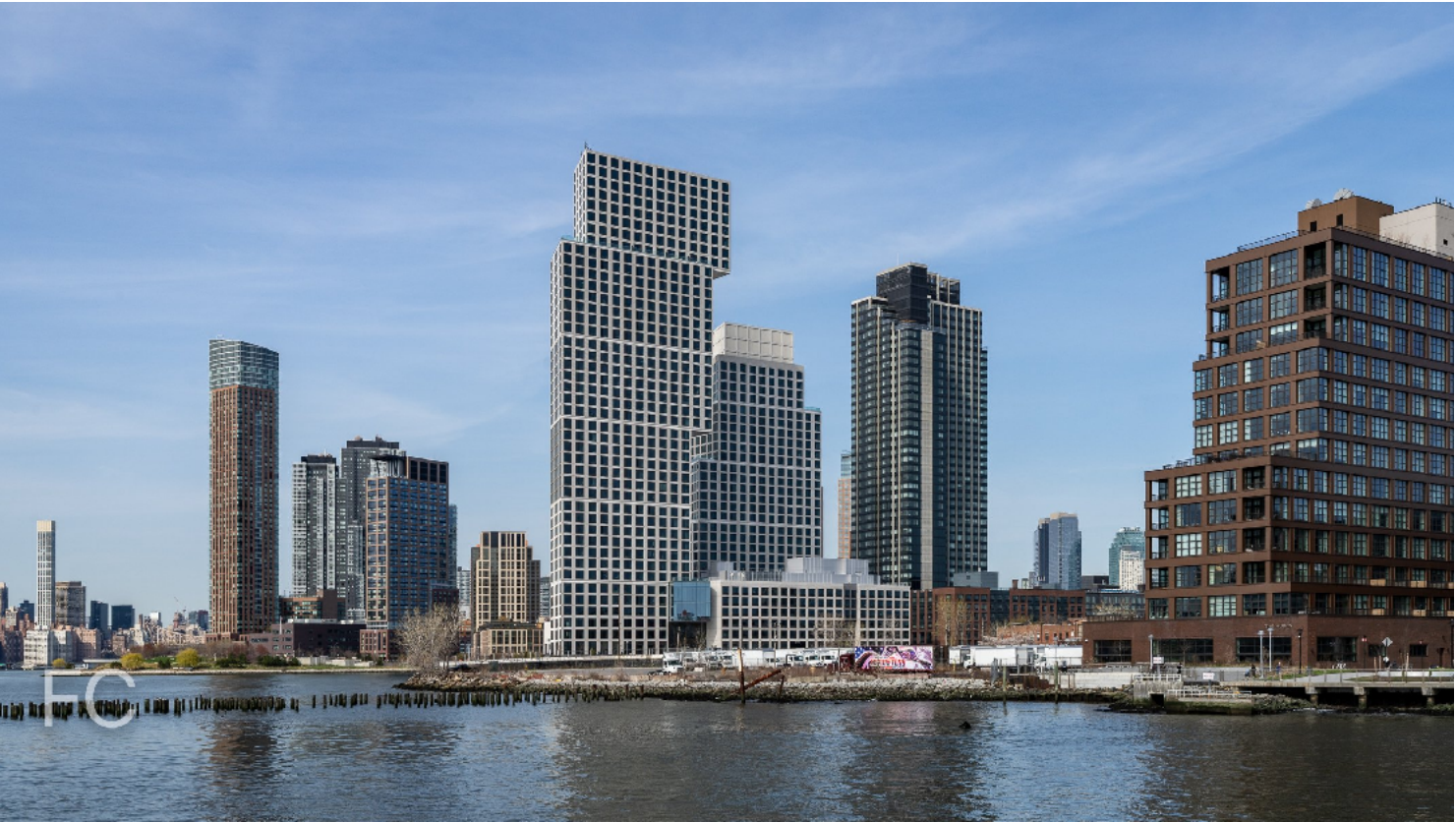
Gotham Point (left), Eagle + West (center), 16 Dupont (right), and The Huron (far right).