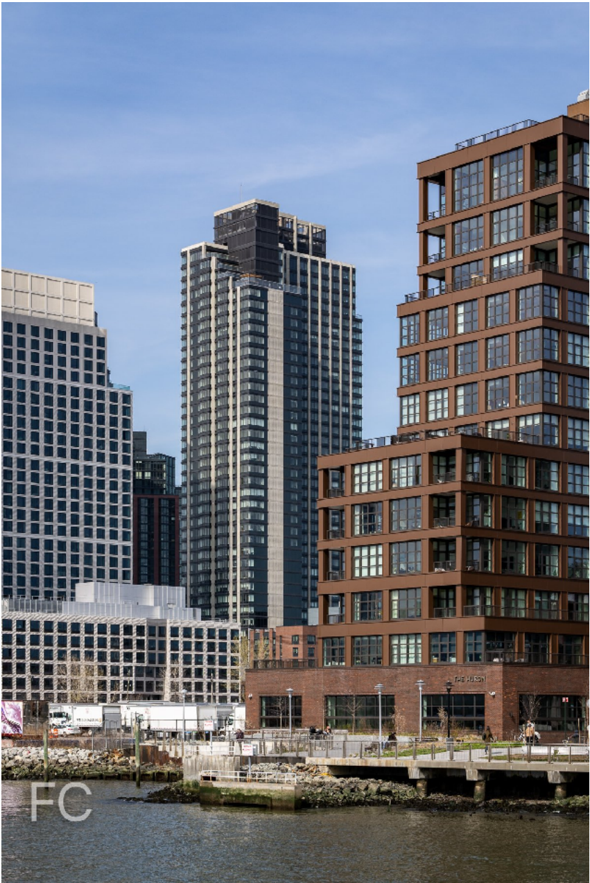
Southwest corner of the tower.