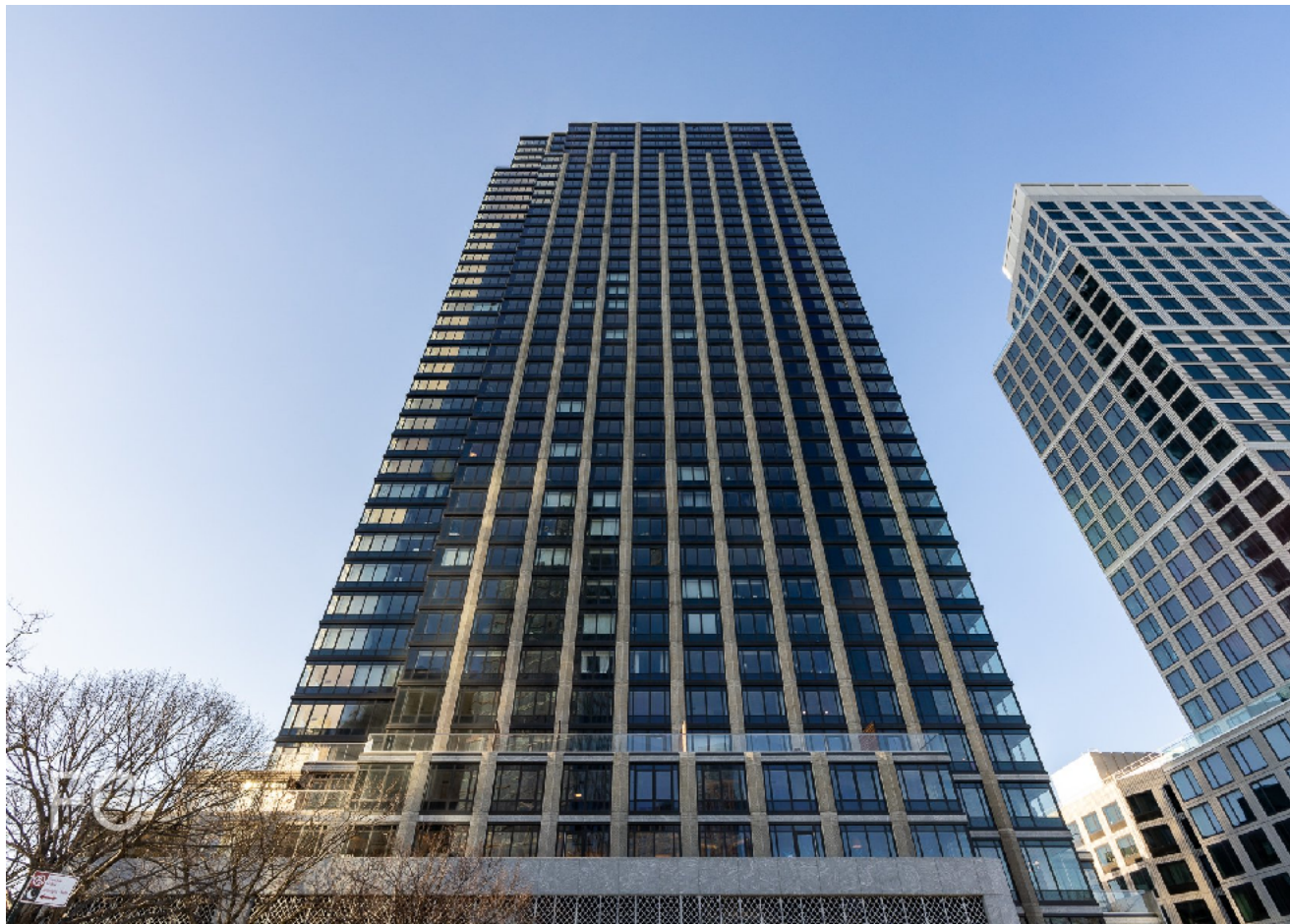
Looking up at the north facade.