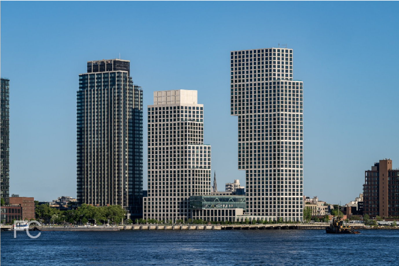
Northwest corner of 16 Dupont (left) and Eagle + West (right).