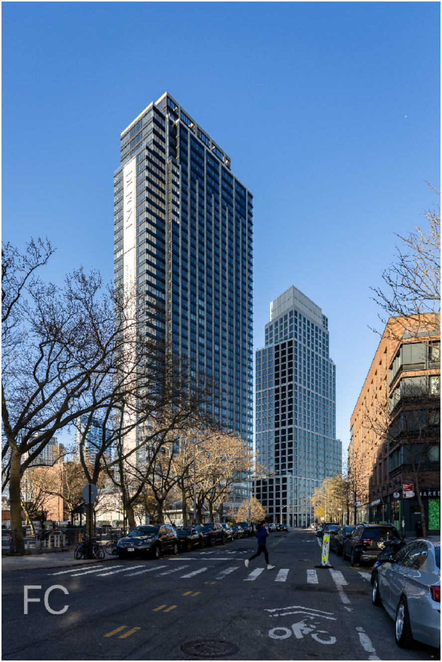
Northeast corner of 16 Dupont (left) and Eagle + West (right) from Commercial Street.