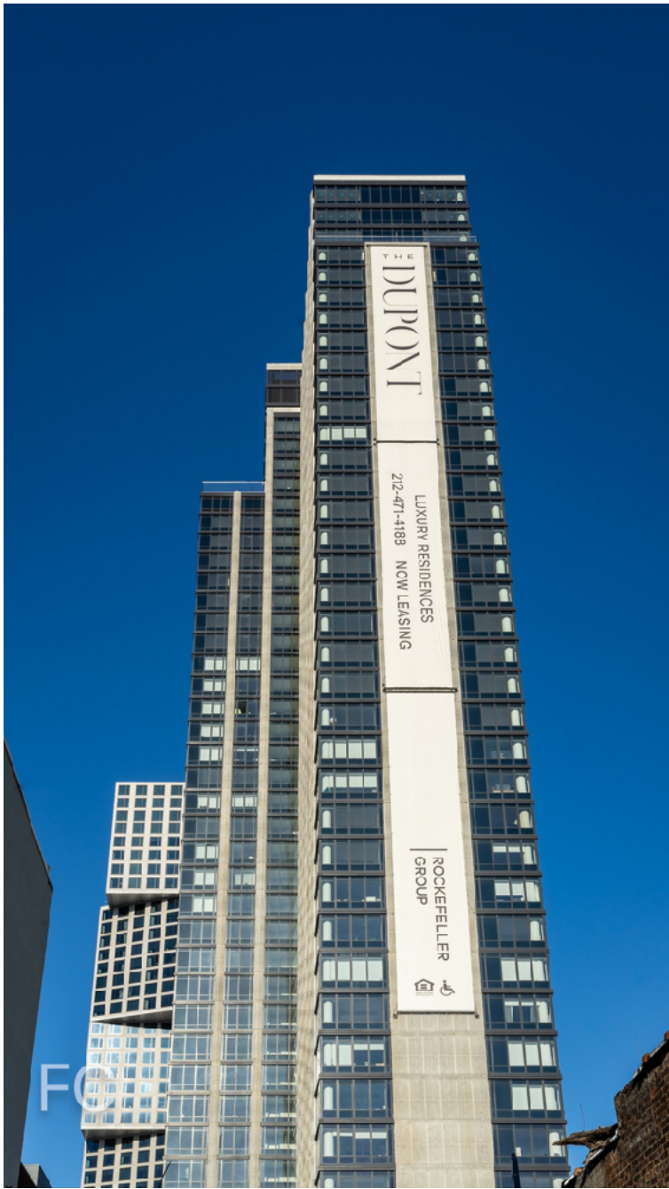
Looking up at the east facade.