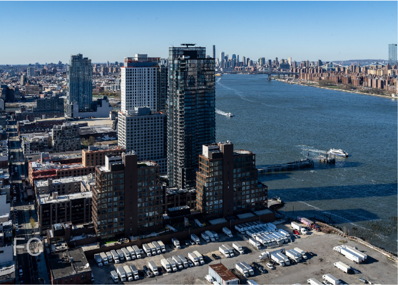
View to the south towards Greenpoint and Lower Manhattan.