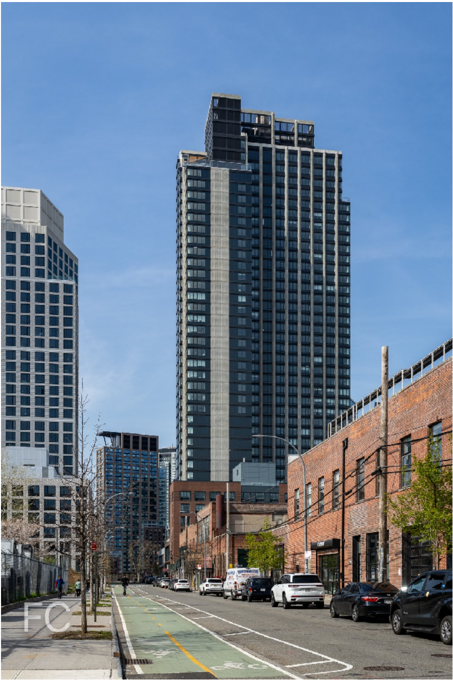
South facade from West Street.