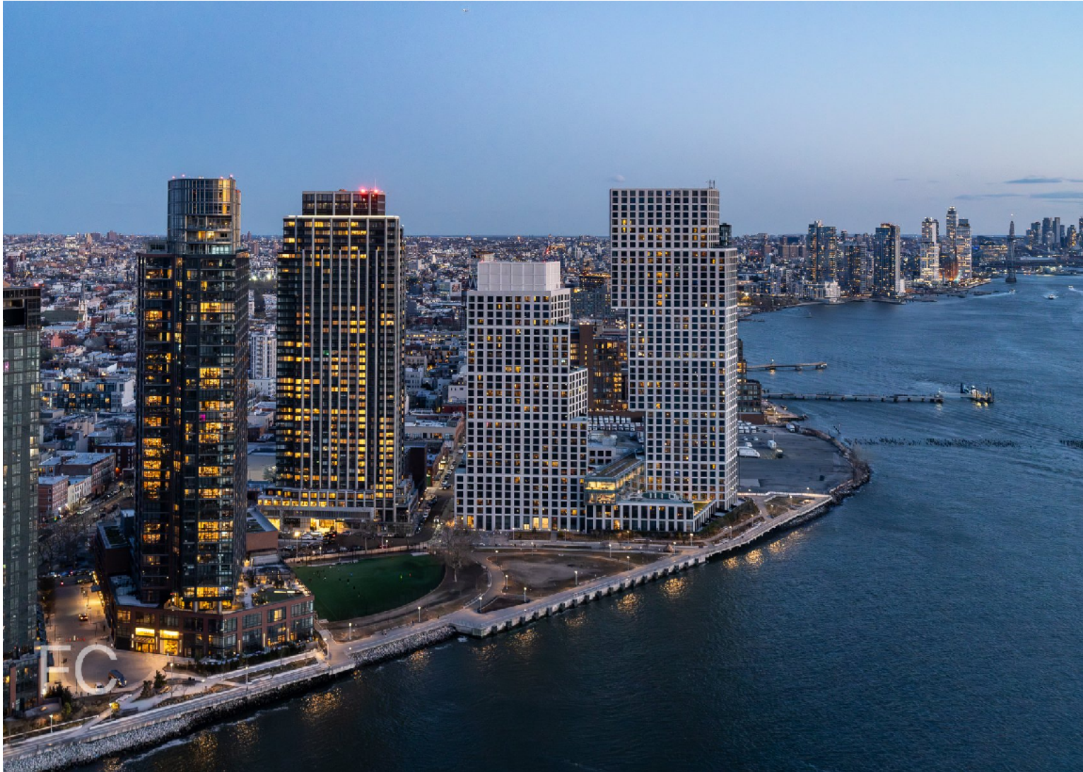
Two Blue Slip (left), 16 Dupont (center), and Eagle + West (right).