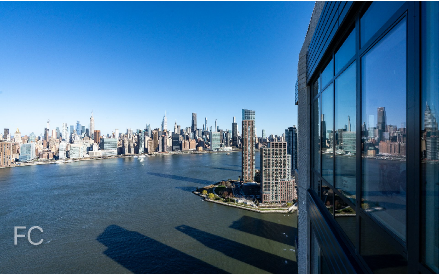
View to the northwest towards Midtown Manhattan and Hunters Point South.