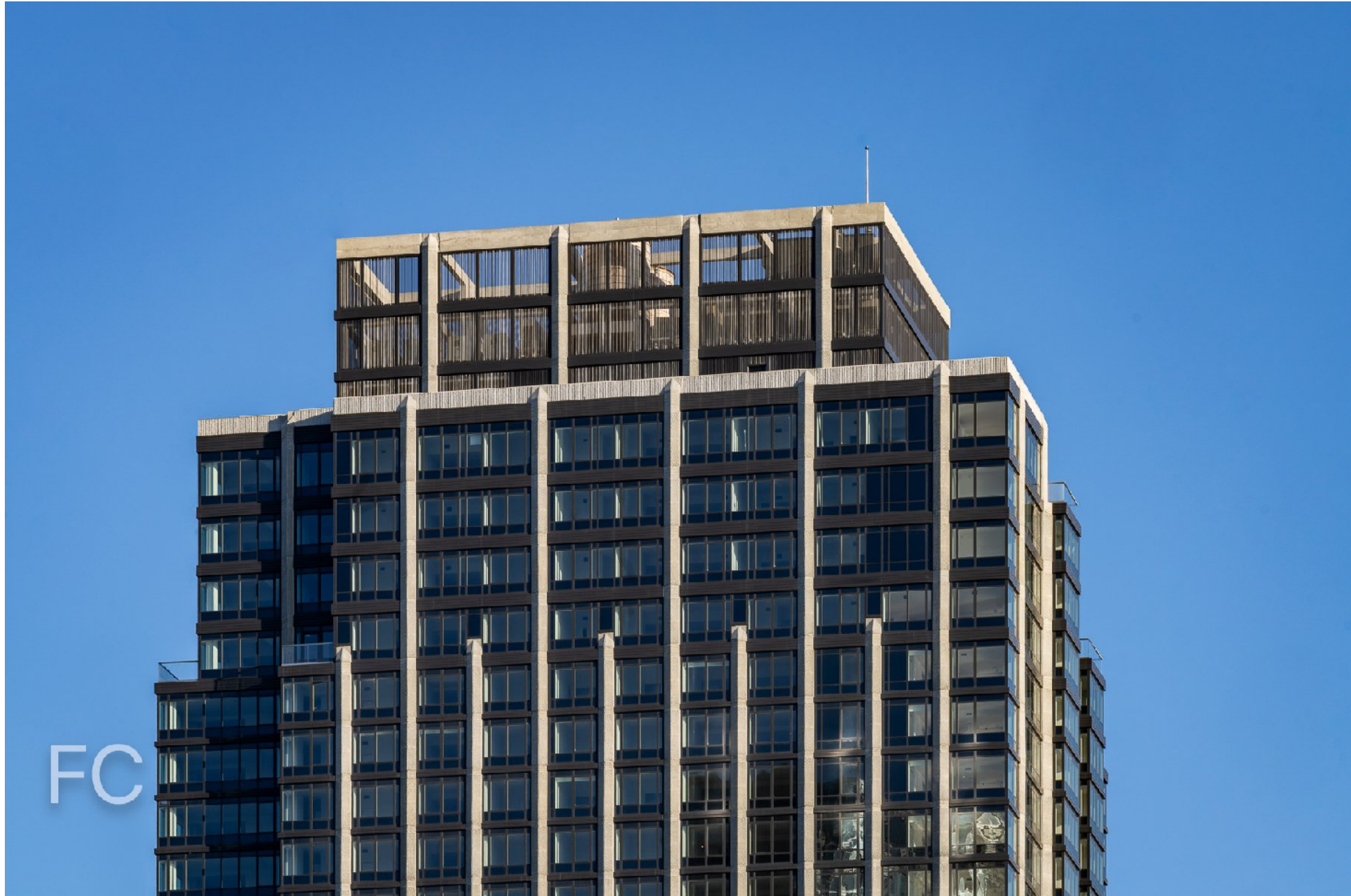
Closeup of the north facade of the tower crown.

Construction has wrapped up at 40-story residential rental tower 16 Dupont at Greenpoint Landing by Rockefeller Group and Park Tower Group. Designed by Gerner Kronick + Valcarel (GKV), the facade features piers of textured cast-in-place concrete with a geometric pattern. Dark toned window wall glazing with metal spandrel covers clads the space between the concrete piers.