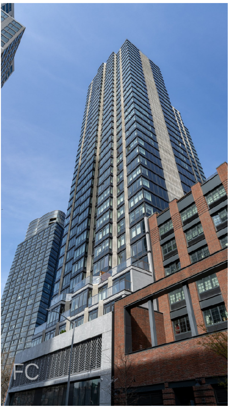
Looking up at the southwest corner of the tower.