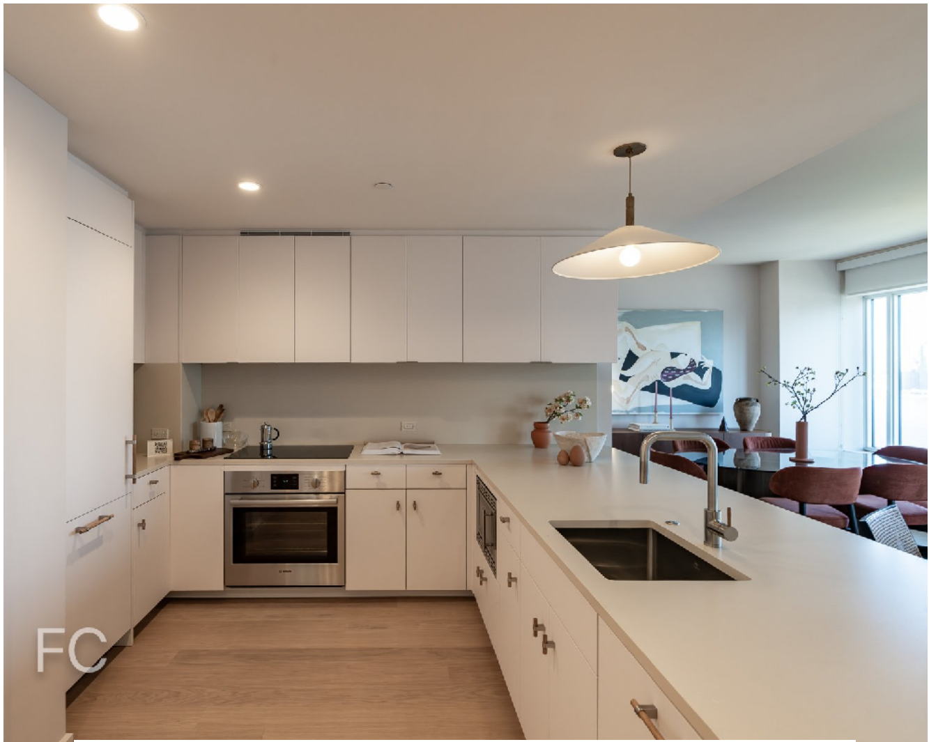
Kitchen with Workstead-designed Italian cabinetry with custom wood hardware.